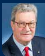
Alexander Downer Former Foreign Minister of Australia