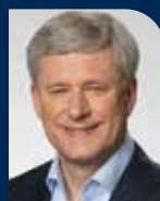
The Hon. Stephen Harper Former Prime Minister of Canada