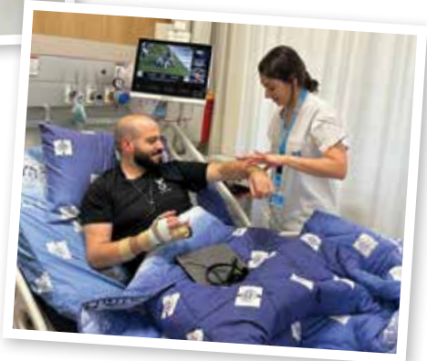
Below: One of the Centre’s first patients

Its first patients were admitted into the War Wounded Department on 12th January. They were welcomed by Hadassah staff clapping and singing “Shalom Aleichem”.