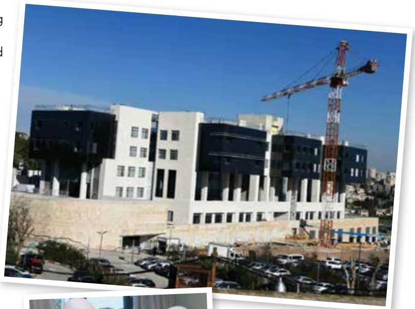
Above: The Gandel Rehabilitation Center under construction

The Centre aims to meet the needs for rehabilitation services in the Jerusalem area which to-date have been severely lacking. Construction of the facility is being made possible by the generosity of the Melbourne-based Gandel family, other Hadassah donors from around the world, as well as the support of the Government of Israel.