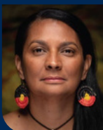
Nova Peris OAM OLY Olympic Champion and Ally